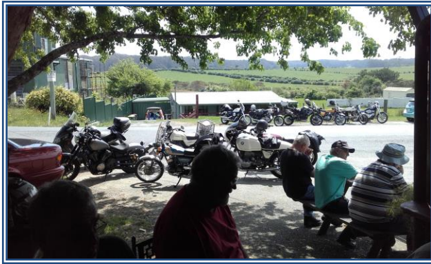
Wednesday morning tea at Lowanna shop.