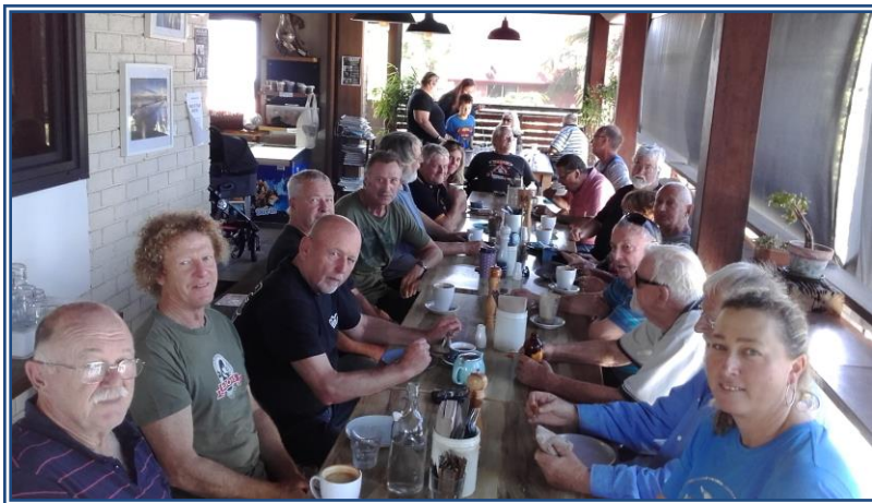
28 th November at Valla Beach Café.

Coffs Motorcycles 1/17-19 Isles Drive, Coffs Harbour. Ph.6652-6000