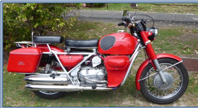
A rare Middle European military Guzzi.