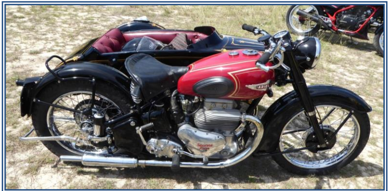
An absolutely beautifully painted Ariel Square four outfit.