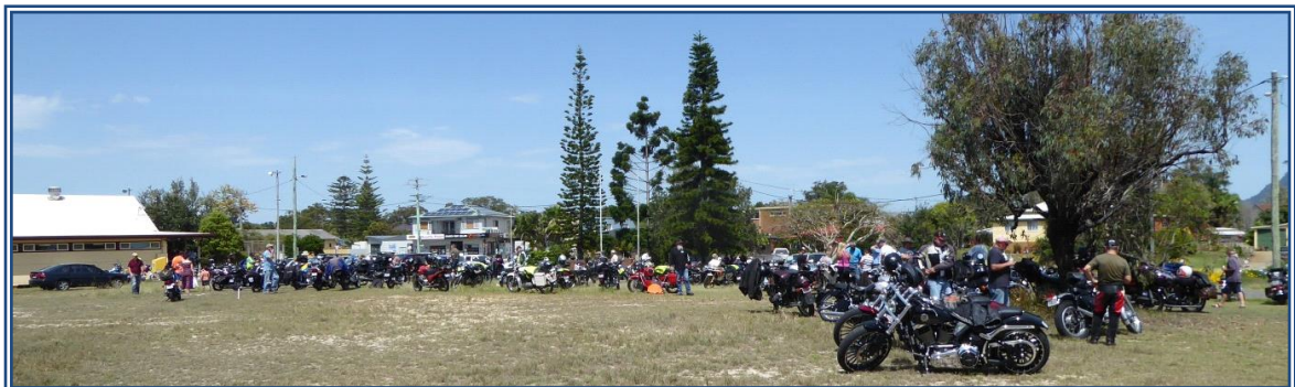
Morning tea stop and judging at Stuarts Point.