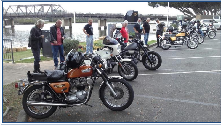
Waiting at Macksville for the returnees from Natureland Rally.