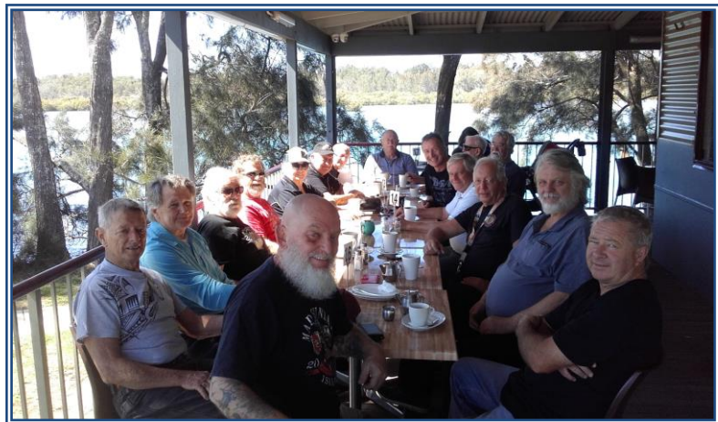
10 th October at Riverside Café, Nambucca and the return of some old regulars to the "Table of Knowledge".