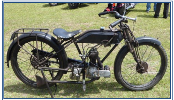
A homemade special with a 350 JAP engine that went like the clappers!